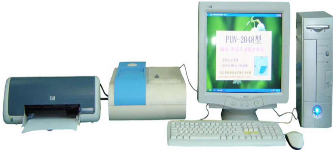
PUN-2048 Four-channel Blood Coagulation and Fibrinolysis Analyzer