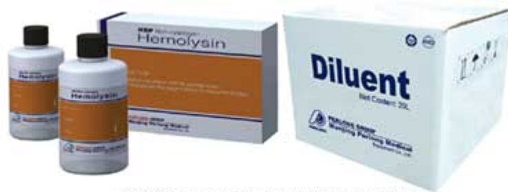
HBP Series--Hematology Analyzer Reagent Kits