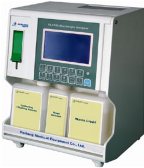
Test items and specification: