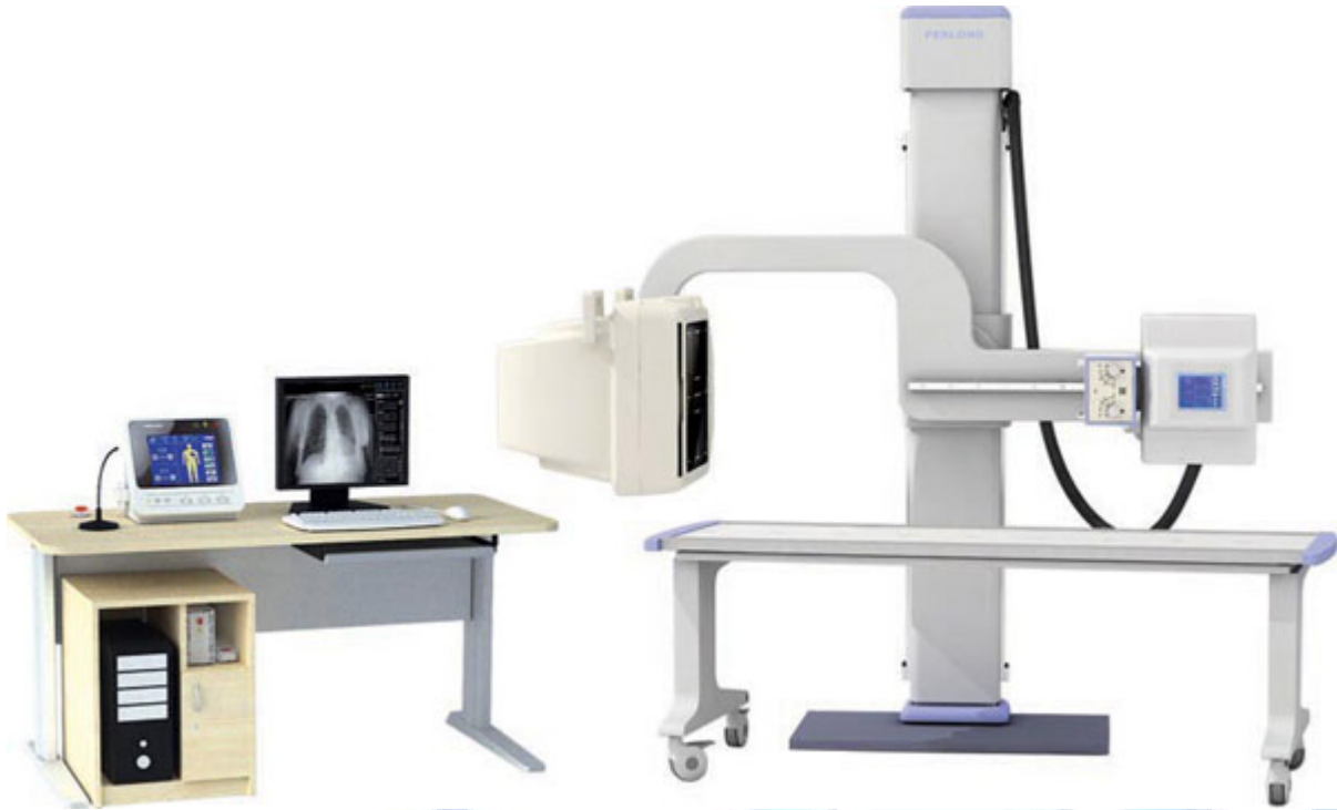
PLX 8200 High-frequency Digital radiography X-ray Machine System