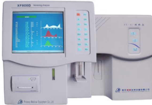
XF9030D Hematology Analyzer(22 Parameters)