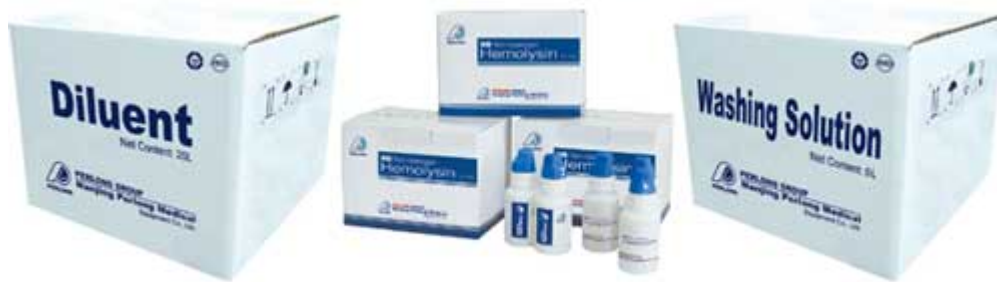
HB Series--Hematology Analyzer Reagent Kits